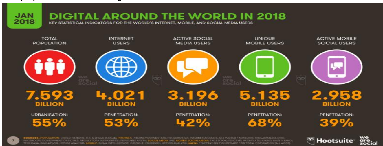
Figure: Statistics showing active Internet and Social Media users

Looking at the statistics above, it can be stated that social media has a wider reach and is increasing every passing day in an exponential manner. 52.6% of the world population now is connected to