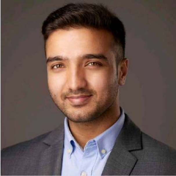
State Minister and Youth Leader