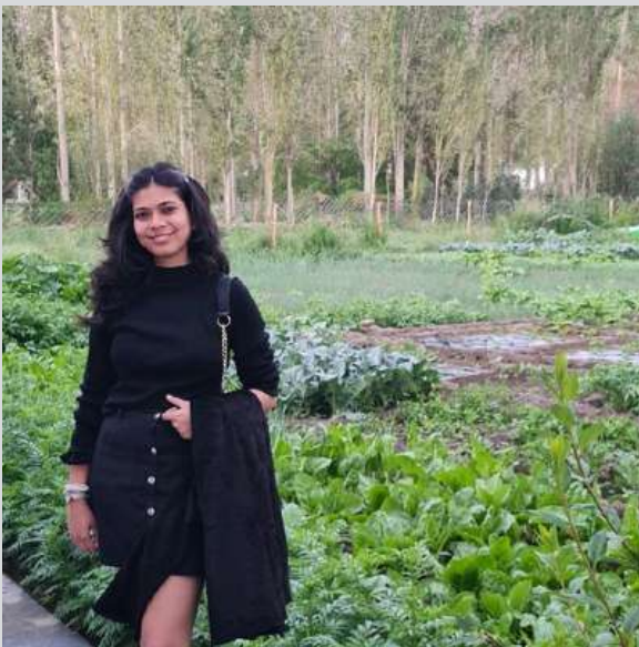
Founder of PG Digital Solution

He won the Provincial Elections in Nepal and is presently a Member of the Parliament of the Provincial Assembly of Nepal and is making the SCMS Family proud.